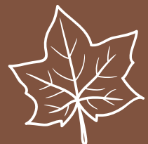
Greenery & flowers