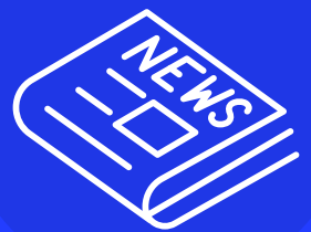
Paper & magazines