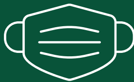
Disposable face masks