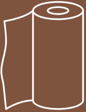
Paper towels & napkins

No Glass No Plastics No Metals No Batteries