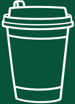
Non-compostable disposable cups