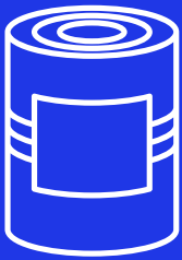
Cans & tins