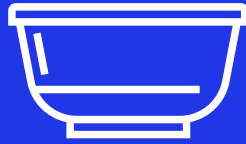
Plastic tubs & trays