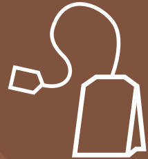
Tea bags & coffee grinds